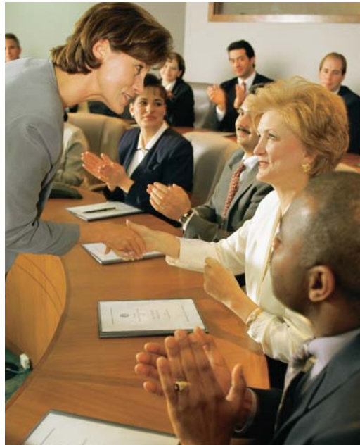
CPMPI real world approach gives you the tools and experience you need to excel.