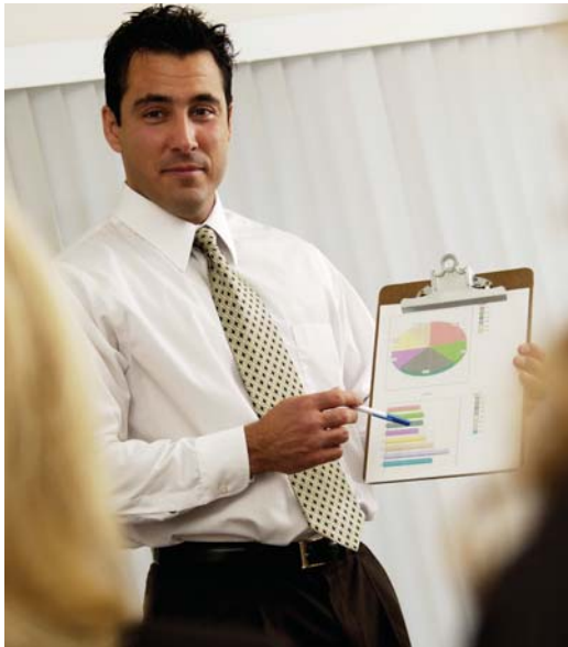
What you learn you are able to put to use immediately.